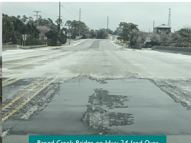
Broad Creek Bridge on Hwy 24 Iced Over