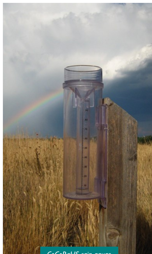
CoCoRaHS rain gauge