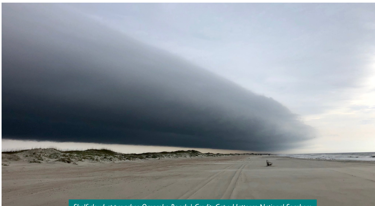
Shelf cloud approaches Ocracoke Beach

By: Erik Heden, Warning Coordination Meteorologist