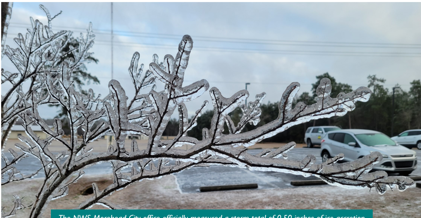
The NWS Morehead City office officially measured a storm total of 0.50 inches of ice accretion

freezing rain for over 12 hours. Power companies reported over 12,000 customers lost power during this event. Major bridges iced over in New Bern, Jacksonville, and across the Morehead City area, leading to numerous vehicle collisions and overnight closures. Luckily, only a few injuries were reported with no deaths.