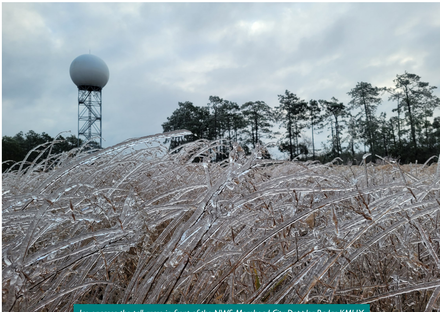
Ice encases the tall grass in front of the NWS Morehead City Doppler Radar KMHX

Snow, sleet, and freezing rain. We saw every form of wintry precipitation here in eastern North Carolina—all in 24 hours. The winter storm of January 21st–22nd will go down in history as an incredibly memorable snow, sleet, and significant ice storm.