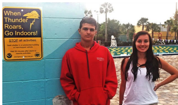
Figure 4: Preparedness reduces lightning risks.

An employer's EAP may include lightning warning or detection systems, which can provide advance warning of lightning hazards. However, no systems can detect the "first strike," detect all lightning, or predict lightning strikes. NOAA recommends that employers first rely on NOAA weather reports, including NOAA Weather Radio All Hazards: www.nws.noaa.gov/nwr .